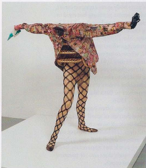
Valérie Blass, Femme panier (Basket Woman) , 2010, stockings, found shirt, hand tool, basket, paint, mannequin, 52 x 59 x 32".

In the dozen sculptures and five collages on view in " Petit losange laqué veiné " (Little Glossed Veined Lozenge), that irony was often directed at gender roles. In the tradition, perhaps, of Louise Bourgeois's Femme Maison —a motif Bourgeois first addressed in the 1940s and returned to periodically thereafter—Blass presented a Femme panier (Basket Woman) and a Femme planche (Board Woman), both 2010. The first is a headless figure whose torso is—you guessed it—made of wicker basketry; but the "femme's" posture is twisted, too, as if to be woven into the pattern of someone's expectations. At once ingratiating and aggressive, she seems to be stepping forward like a dancer executing an oddly unstable