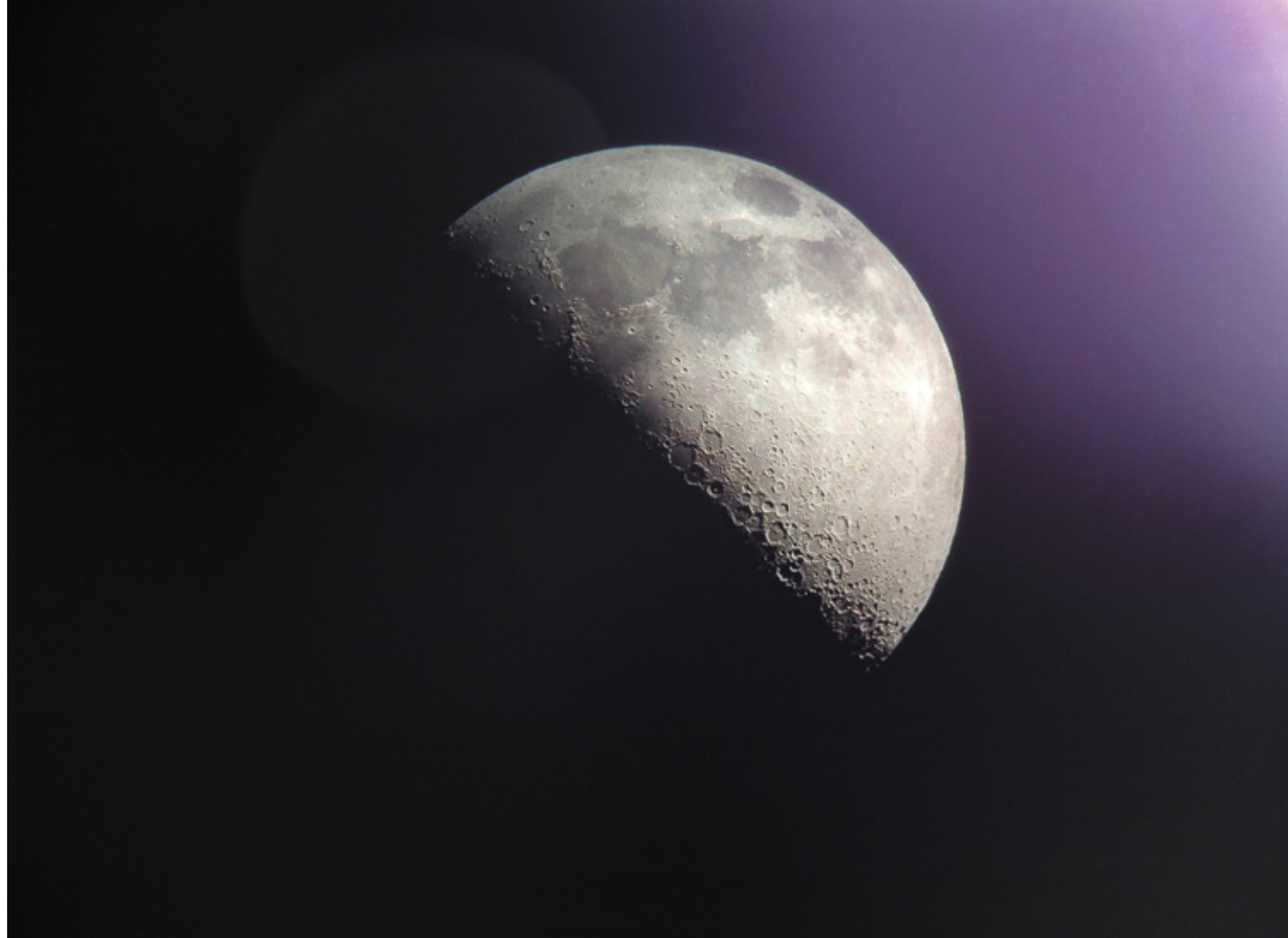
Erin Shirreff Moon (still) 2010 Colour video, silent 32 min loop